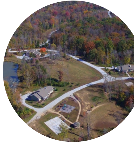
NEW SONG MISSION CAMPUS

We hope to see your child on campus soon!