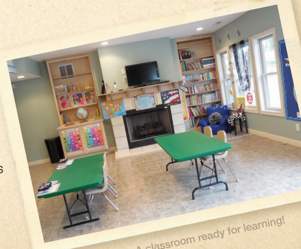
Home A classroom ready for learning!

Rebuilding the lives of children, through the love of Christ Jesus.