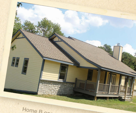
Home B occupancy permit received!

98 monthly sponsors! Every New Song home needs 108 monthly sponsors whose gifts will provide for the physical, educational, spiritual, and emotional needs