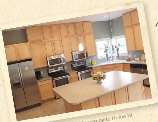
Appliances help to complete Home B!

Thanks to several generous ministry supporters, ground was broken this fall on New Song's recreational park. The park will be a beautiful addition to the campus and will provide children with a fun place to enjoy, while also providing much needed therapeutic benefits to the kids we will serve. The park will include a kickball area, a basketball/pickleball court, a small climbing hill, a gigantic playground set, and a very special memorial/honorarium brick walk. Nearly $40,000 has been received so far for the $78,000 park project!