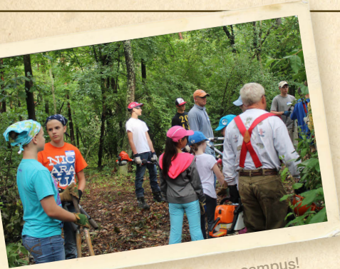
Volunteers hard at work on campus!

New Song Mission is a 501 (c) (3) nonprofit ministry, which is solely supported through the generosity of ministry friends—thanks for helping us rebuild children's lives!